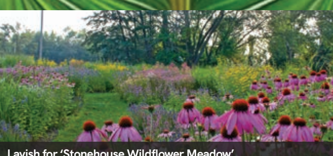
Lavish for 'Stonehouse Wildflower Meadow'