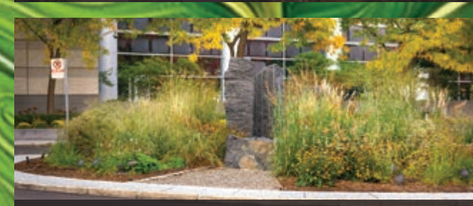
International Landscaping Inc for 'Native Perennial Pollinator Garden' - Theme Gardens