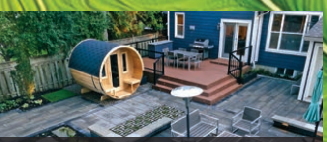
Green Roots Landscaping for 'Patton' Residential Construction $50,000 - $100,000