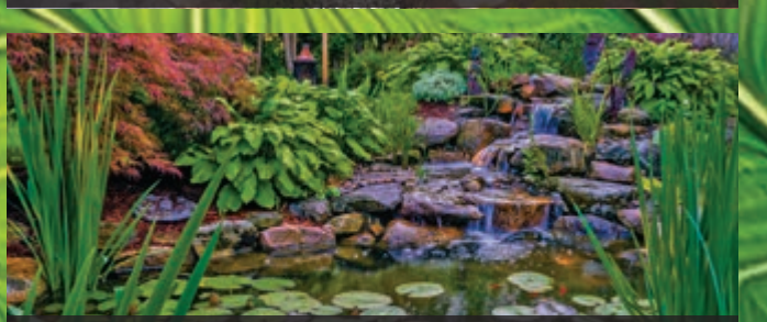
Jackson Pond for 'Carson's Paw'nd' Water Features