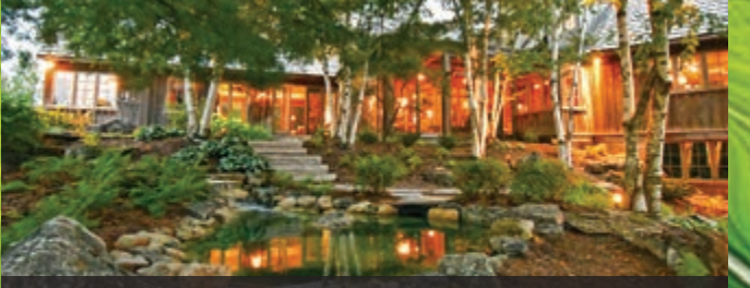
Whispering Pines Landscaping for 'Country Living' Residential Construction $100,000 - $250,000