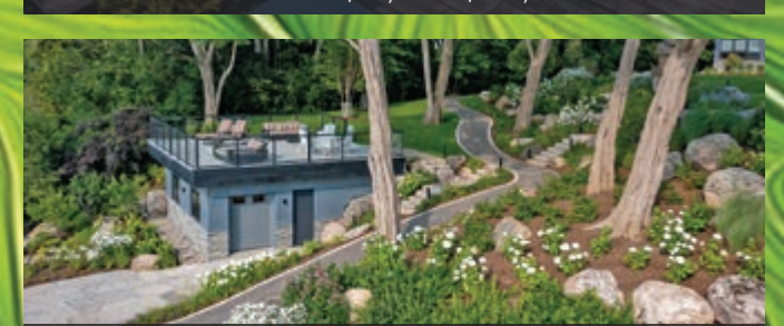
Rockscape for 'Lake Simcoe Residence' Residential Construction over $1,000,000