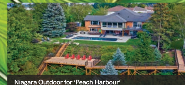
Niagara Outdoor for 'Peach Harbour' Residential Construction $100,000 - $250,000